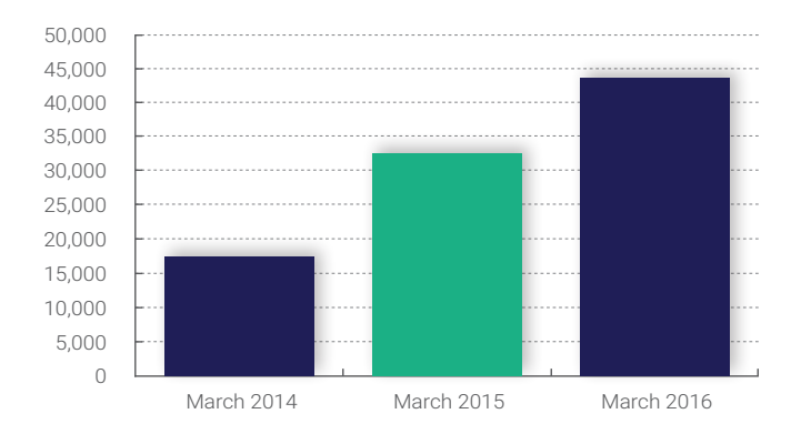
Table 4: Value of deposits protected at year end

Source: Department for Communities statistics